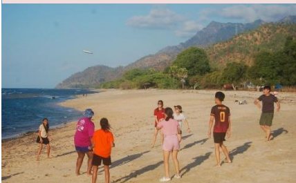
Beach games with students from St Paul's Methodist School in Metinaro, a school established by Singaporeans.