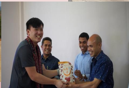
Our students visited local universities and engaged local youth.