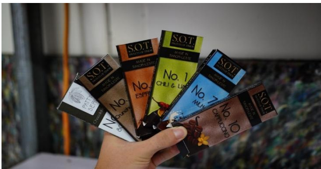
Our visit to Sweets of Timor, a local enterprise in Dili that sells chocolate using locally sourced ingredients