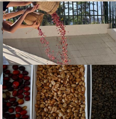
Pouring freshly picked coffee cherries for processing in Ermera, ~800m above sea level.